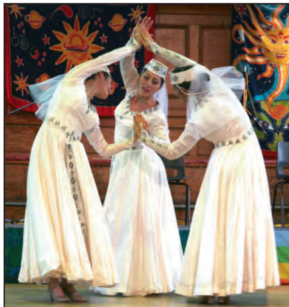
The Aghktamar Armenian Dance Group performed at the Dance Around the World festival at Cecil Sharp House on October 24th, 2010.

Finally the 24th April 2011 will be the 10th anniversary of the recognition of the Armenian Genocide by the leaders of all four parties in the National Assembly of Wales and by all major Churches of Wales (Church in Wales, Non-Conformist Churches and the Roman Catholic Church) ■