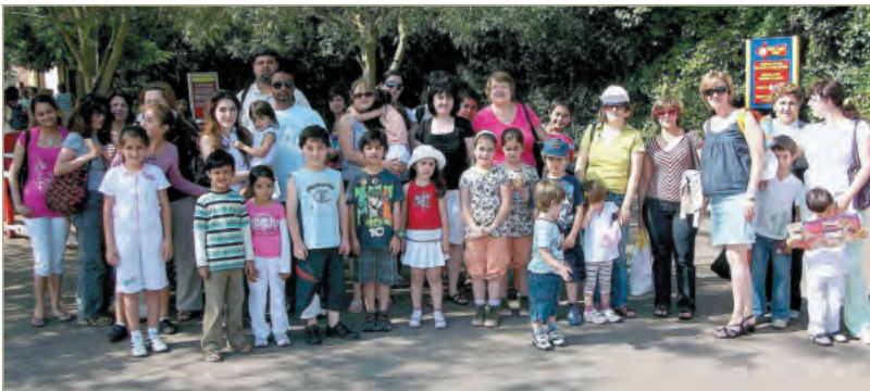
Her yıl Ermeni Toplum Merkezi öğrencileri için düzenlenen yaz şenliği aileleri bir araya getiriyor.

18'in üzerinde ülkeye dağılmış olan Ermenilerin özellikle yoğun olarak yaşadıkları ülkeler; Rusya, Fransa, USA, Gürcistan, Suriye, Lübnan, Ar-